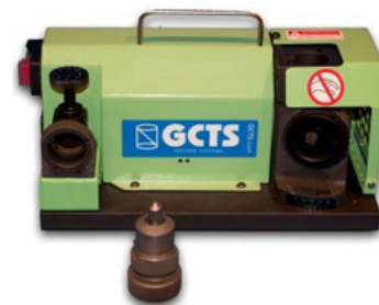
Optional steel indenter (stylus) sharpening tool

Note: Requires microscope to measure wear flat on the steel cone. Sold as an option.