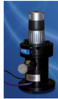
Digital microscope and indenter holding fixture