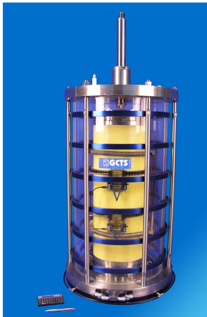
STX-600 Dynamic Triaxial Cell

The STX-600 system includes a pressure control panel complete with servo control of the cell and back pressure, 20 liter fluid reservoir, venturi vacuum pump, volume change device, automatic ball valve, flow indicators, etc. making this panel very convenient and easy to operate. A Pressure gauge provides visual verification of confining and pore pressures. Convenient "quick-connect" fittings allow for easy connection of pressure lines and filling/draining the fluid reservoirs. Sight tubes are also available to show the available amount of fluid in each fluid circuit. Each pressure controller allows for the servo control of the confining and back pressure as a function of pressure or any other measured or calculated test parameter. With both pressure controllers, advance tests such as stress/strain path, K_0 , permeability, etc. can be easily performed.