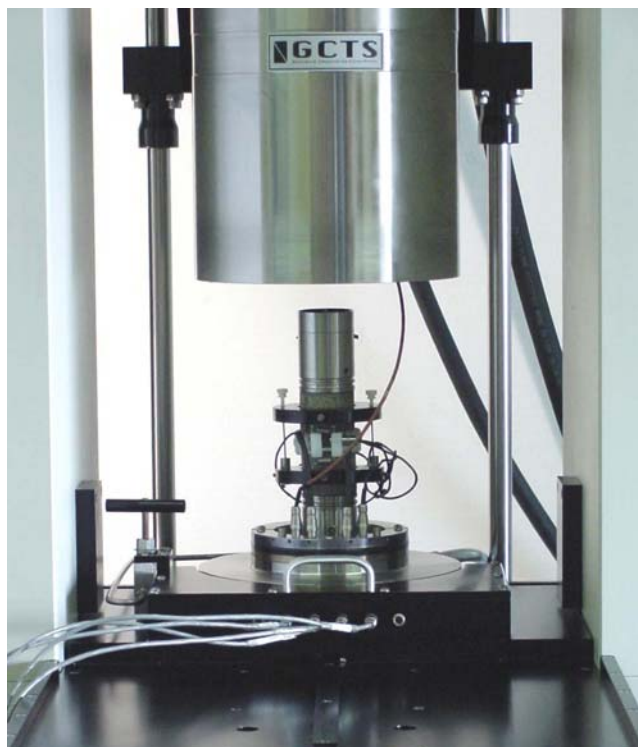
Internal load and deformation measurements

An automatic hydraulic lift and a sliding base for the triaxial cell are included with this system for fast and easy specimen setup as compared to conventional triaxial cells. Fast assembly/disassembly of the cell is achieved with the push of a single button. No bolts or other fasteners are used to assemble the triaxial cell, resulting in more time dedicated to testing.